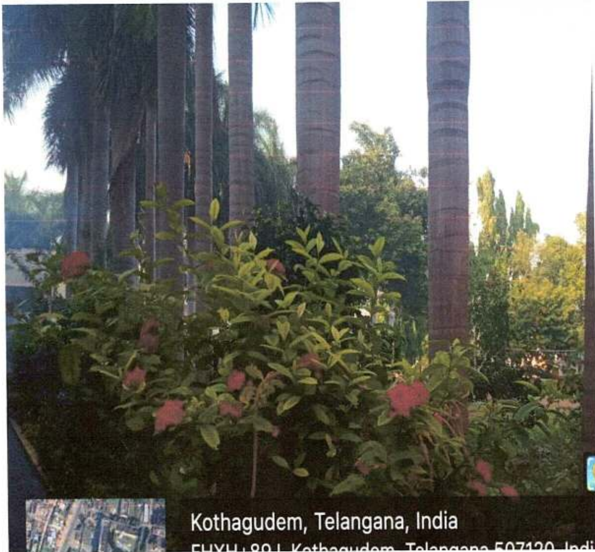
Lawn landscaping at AKITS College