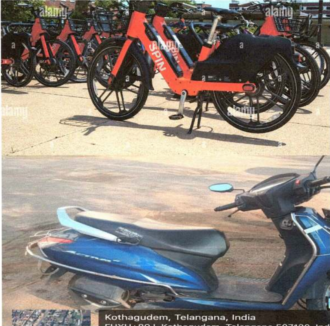
Kothagudem, Telangana, India