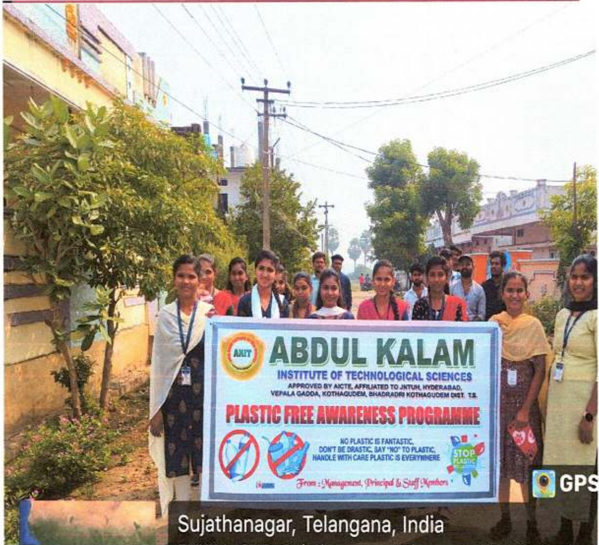
PLASTIC-FREE awareness programme by AKITS NSS students at nearest village (sujathanagar)