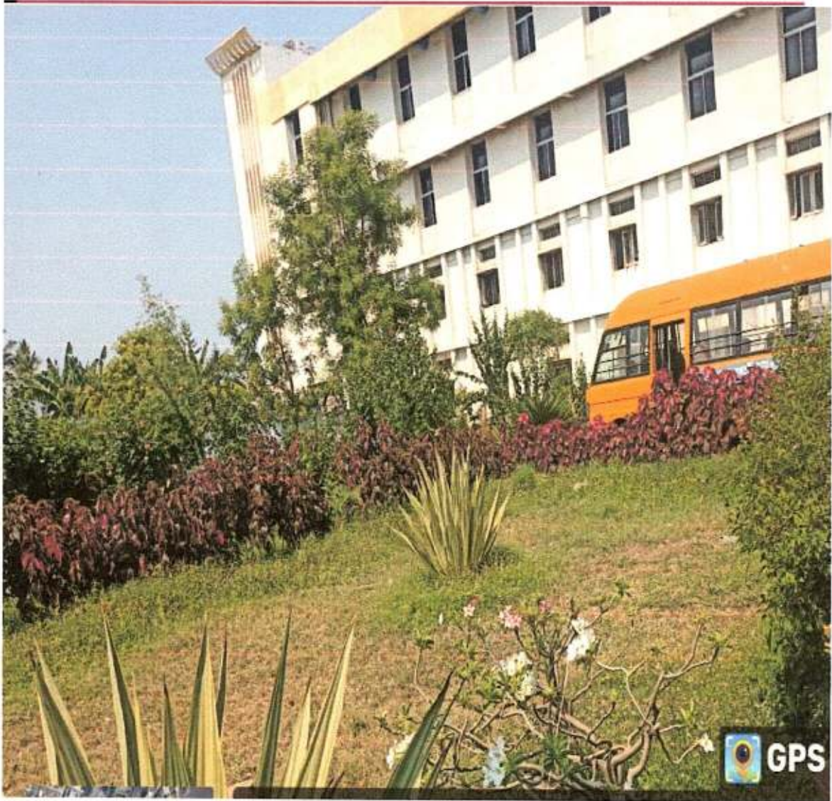
Birds view of landscaping in the college campus