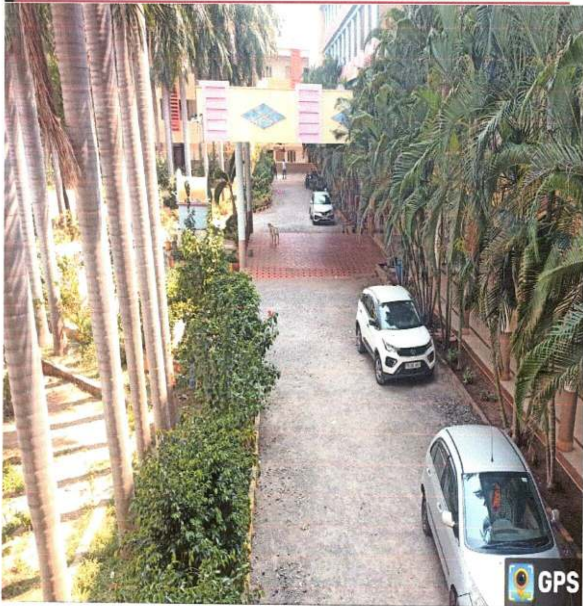
Car parking outside of the campus