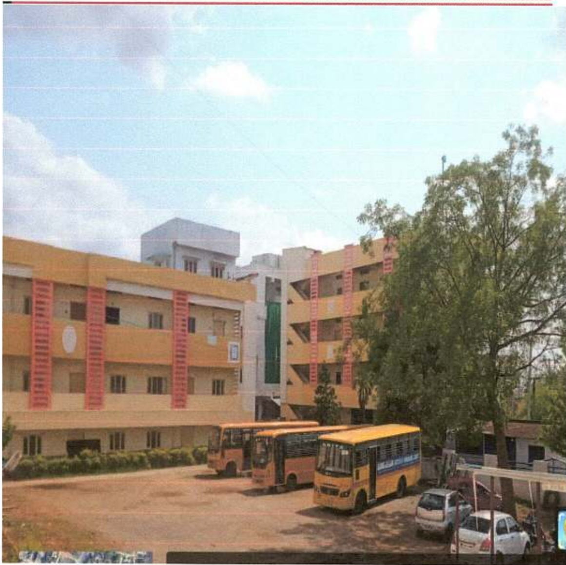
Bus parking outside of the main gate